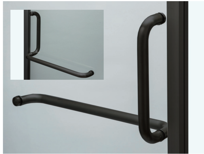
L Type (Black Painting)