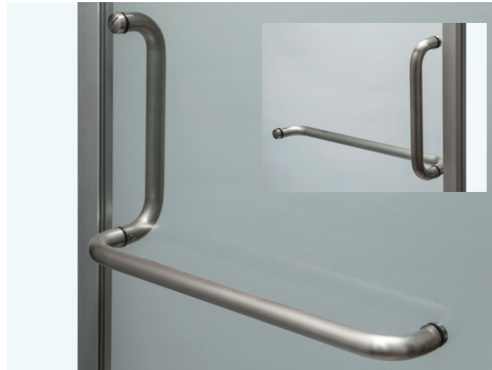
L Type (Hairline)